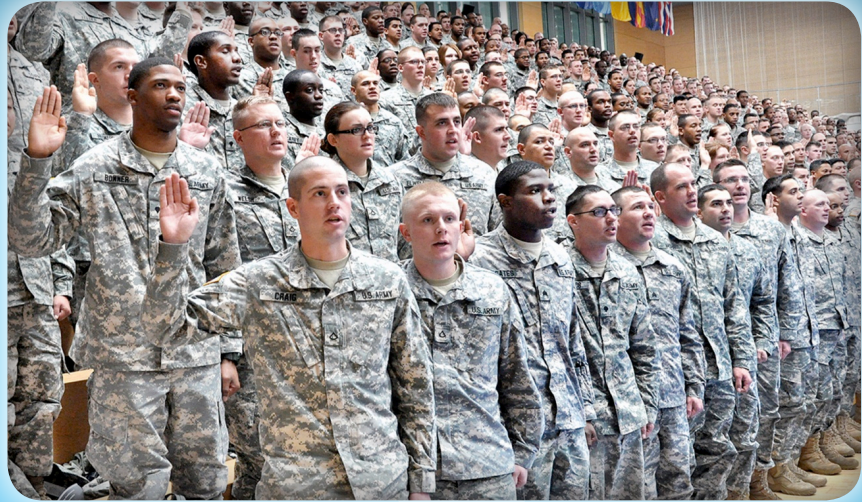
U.S. soldiers reaffirm their oath during the 5th Signal Command's Operation Solemn Promise commemoration event, Nov. 16, 2012, at the Wiesbaden Fitness Center, U.S. Army Garrison Wiesbaden, Germany.